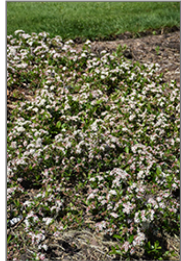
Ground Hug Aronia in bloom

Ground Hug Aronia is recommended for the following landscape applications;