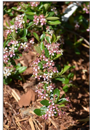
Ground Hug Aronia flowers