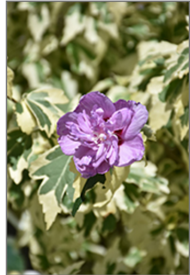
Sugar Tip Gold Rose of Sharon flowers

This is a high maintenance shrub that will require regular care and upkeep, and is best pruned in late winter once the threat of extreme cold has passed. It is a good choice for attracting butterflies and hummingbirds to your yard, but is not particularly attractive to deer who tend to leave it alone in favor of tastier treats. Gardeners should be aware of the following characteristic(s) that may warrant special consideration;