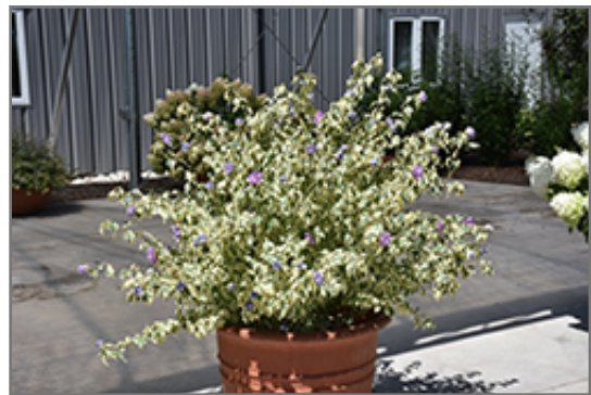
Sugar Tip Gold Rose of Sharon in bloom