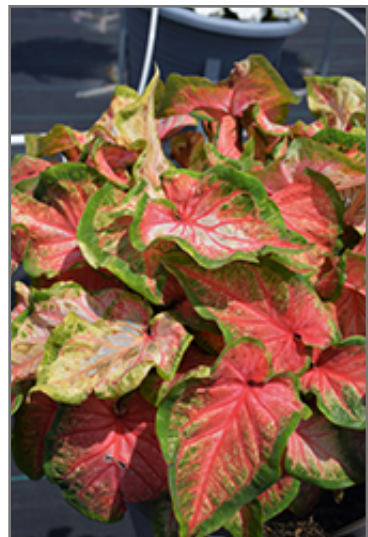
Heart to Heart Chinook Caladium foliage