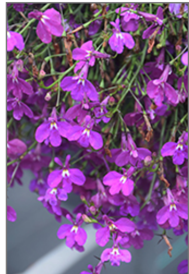
Laguna Ultraviolet Lobelia flowers