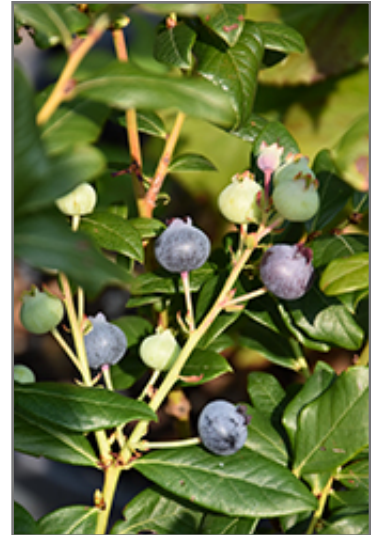
Perpetua Blueberry fruit

This is a multi-stemmed deciduous shrub with a mounded form. Its average texture blends into the landscape, but can be balanced by one or two finer or coarser trees or shrubs for an effective composition. This is a relatively low maintenance plant, and usually looks its best without pruning, although it will tolerate pruning. It is a good choice for attracting birds to your yard. It has no significant negative characteristics.