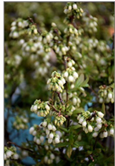
Perpetua Blueberry flowers