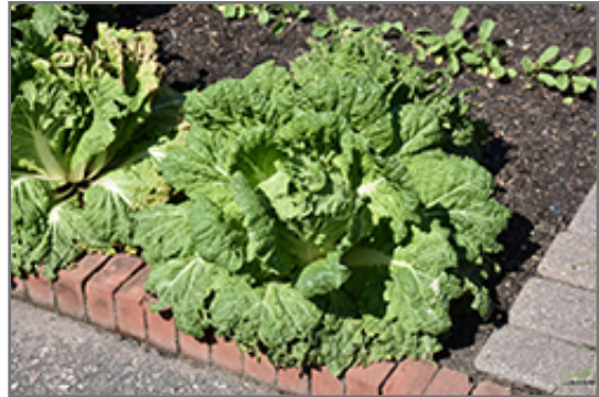
Napa Cabbage

This plant is typically grown in a designated vegetable garden. It does best in full sun to partial shade. It does best in average to evenly moist conditions, but will not tolerate standing water. It is not particular as to soil pH, but grows best in rich soils. It is somewhat tolerant of urban pollution. Consider applying a thick mulch around the root zone over the growing season to conserve soil moisture. This species is not originally from North America.