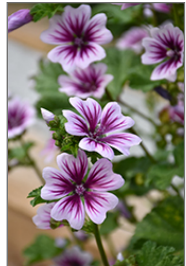
Zebrina Mallow flowers