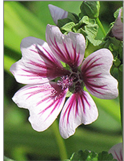
Zebrina Mallow flowers