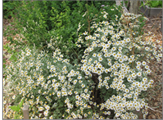
German Chamomile

This plant is quite ornamental as well as edible, and is as much at home in a landscape or flower garden as it is in a designated herb garden. It does best in full sun to partial shade. It is very adaptable to both dry and moist locations, and should do just fine under typical garden conditions. It is not particular as to soil type or pH. It is somewhat tolerant of urban pollution. This species is not originally from North America.