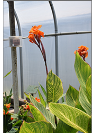
Bengal Tiger Canna flowers

This plant should only be grown in full sunlight. It requires an evenly moist well-drained soil for optimal growth, but will die in standing water. It is not particular as to soil pH, but grows best in rich soils. It is highly tolerant of urban pollution and will even thrive in inner city environments, and will benefit from being planted in a relatively sheltered location. Consider applying a thick mulch around the root zone in winter to protect it in exposed locations or colder microclimates. This particular variety is an interspecific hybrid. It can be propagated by division; however, as a cultivated variety, be aware that it may be subject to certain restrictions or prohibitions on propagation.