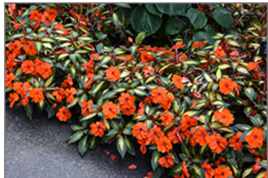
SunPatiens Vigorous Tropical Orange New Guinea Impatiens in bloom