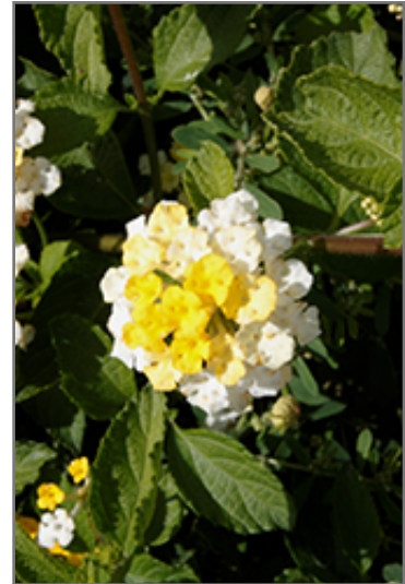
Landscape Bandana Lemon Zest Lantana flowers

Landscape Bandana Lemon Zest Lantana is recommended for the following landscape applications;