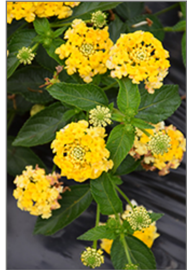
Landscape Bandana Lemon Zest Lantana flowers

Landscape Bandana Lemon Zest Lantana is a fine choice for the garden, but it is also a good selection for planting in outdoor containers and hanging baskets. Because of its spreading habit of growth, it is ideally suited for use as a 'spiller' in the 'spiller-thriller-filler' container combination; plant it near the edges where it can spill gracefully over the pot. Note that when growing plants in outdoor containers and baskets, they may require more frequent waterings than they would in the yard or garden.