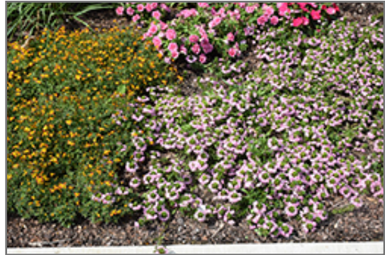
Surdiva Classic Pink Fan Flower flowers

Surdiva Classic Pink Fan Flower will grow to be about 10 inches tall at maturity, with a spread of 24 inches. When grown in masses or used as a bedding plant, individual plants should be spaced approximately 18 inches apart. Its foliage tends to remain low and dense right to the ground. This fast-growing annual will normally live for one full growing season, needing replacement the following year.