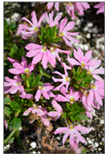
Surdiva Classic Pink Fan Flower flowers