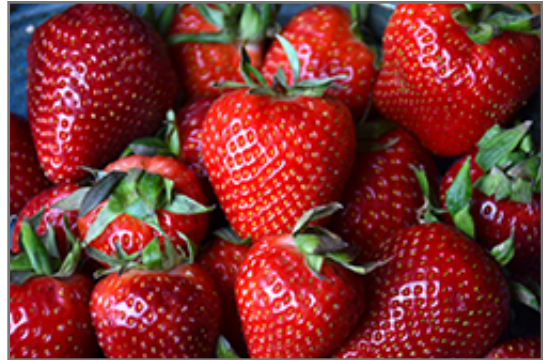
Albion Strawberry fruit