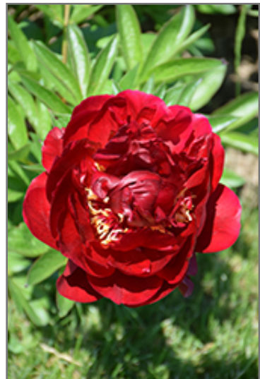
Buckeye Belle Peony flowers