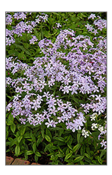
Woodland Phlox flowers

Woodland Phlox will grow to be about 8 inches tall at maturity, with a spread of 18 inches. When grown in masses or used as a bedding plant, individual plants should be spaced approximately 16 inches apart. Its foliage tends to remain low and dense right to the ground. It grows at a medium rate, and under ideal conditions can be expected to live for approximately 10 years. As an herbaceous perennial, this plant will usually die back to the crown each winter, and will regrow from the base each spring. Be careful not to disturb the crown in late winter when it may not be readily seen!