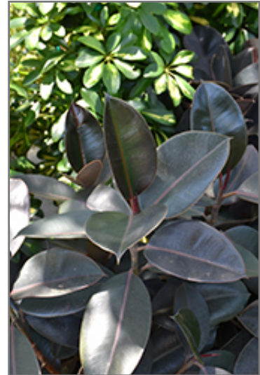
Burgundy Bush Rubber Plant foliage

When grown indoors, Burgundy Bush Rubber Plant can be expected to grow to be about 8 feet tall at maturity, with a spread of 6 feet. It grows at a medium rate, and under ideal conditions can be expected to live for approximately 50 years. This houseplant will do well in a location that gets either direct or indirect sunlight, although it will usually require a more brightly-lit environment than what artificial indoor lighting alone can provide. It prefers dry to average moisture levels with very well-drained soil, and may die if left in standing water for any length of time. This plant should be watered when the surface of the soil gets dry, and will need watering approximately once each week. Be aware that your particular watering schedule may vary depending on its location in the room, the pot size, plant size and other conditions; if in doubt, ask one of our experts in the store for advice. It is not particular as to soil type or pH; an average potting soil should work just fine.