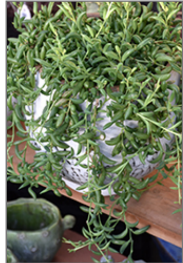
String of Bananas

When grown indoors, String of Bananas can be expected to grow to be only 6 inches tall at maturity, with a spread of 24 inches. It grows at a medium rate, and under ideal conditions can be expected to live for approximately 10 years. This houseplant will do well in a location that gets either direct or indirect sunlight, although it will usually require a more brightly-lit environment than what artificial indoor lighting alone can provide. It prefers dry to average moisture levels with very well-drained soil, and may die if left in standing water for any length of time. This plant should be watered when the surface of the soil gets dry, and will need watering approximately once each week. Be aware that your particular watering schedule may vary depending on its location in the room, the pot size, plant size and other conditions; if in doubt, ask one of our experts in the store for advice. It is not particular as to soil type or pH; an average potting soil should work just fine.