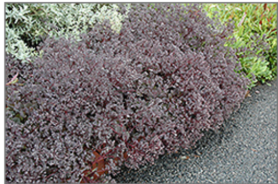
Bertram Anderson Stonecrop