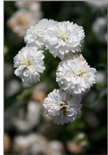
Diadem Double Yarrow flowers

Diadem Double Yarrow is recommended for the following landscape applications;