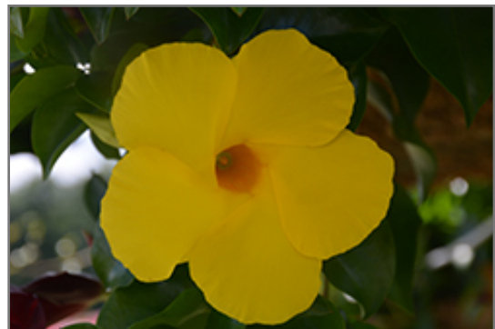
Diamantina Opal Yellow Mandevilla flowers