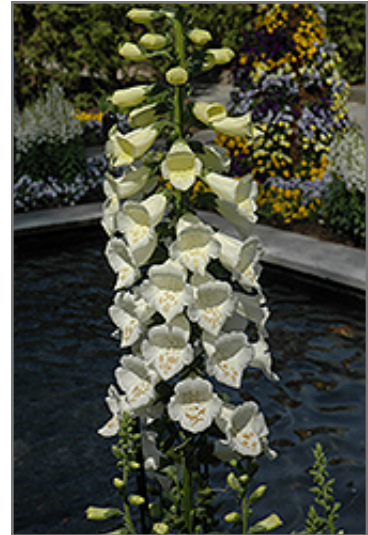
Camelot White Foxglove flowers

Camelot White Foxglove is recommended for the following landscape applications;