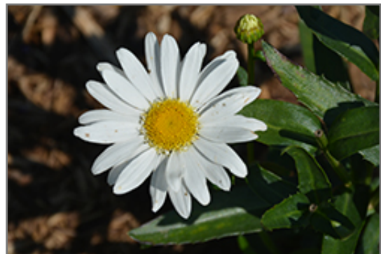
Sweet Daisy Birdy Shasta Daisy flowers