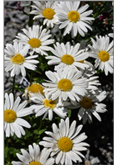
Sweet Daisy Birdy Shasta Daisy flowers