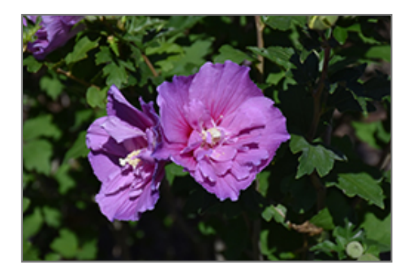
Dark Lavender Chiffon Rose Of Sharon flowers

This is a high maintenance shrub that will require regular care and upkeep, and is best pruned in late winter once the threat of extreme cold has passed. It is a good choice for attracting bees, butterflies and hummingbirds to your yard, but is not particularly attractive to deer who tend to leave it alone in favor of tastier treats. Gardeners should be aware of the following characteristic(s) that may warrant special consideration;