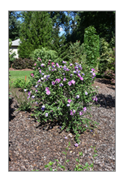
Dark Lavender Chiffon Rose Of Sharon in bloom