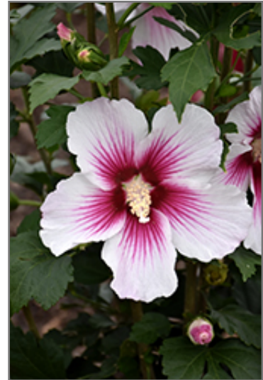
Paraplu Pink Ink Rose of Sharon flowers

Paraplu Pink Ink Rose of Sharon is recommended for the following landscape applications;