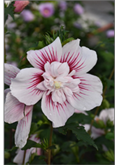
Starblast Chiffon Rose of Sharon flowers

Starblast Chiffon Rose of Sharon is recommended for the following landscape applications;