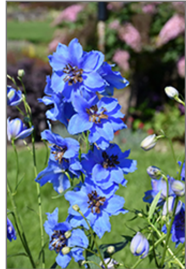
Blue Buccaneers Larkspur flowers