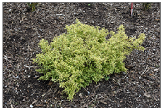
Bubbly Wine Weigela