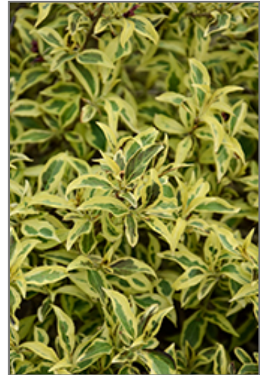
Bubbly Wine Weigela foliage

Bubbly Wine Weigela is recommended for the following landscape applications;