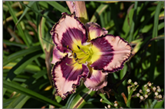
Rainbow Rhythm Sound of My Heart Daylily flowers

Beautiful pastel pink flowers with large, deep red eyezones and matching ruffled edges, rise above low growing mounds of arching green foliage; wonderful reblooming quality; excellent for adding softness to beds, borders or containers