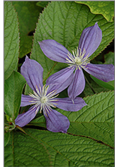
Arabella Clematis flowers