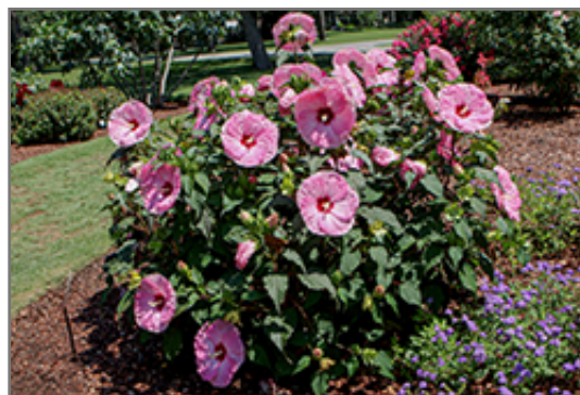
Summerific Spinderella Hibiscus in bloom