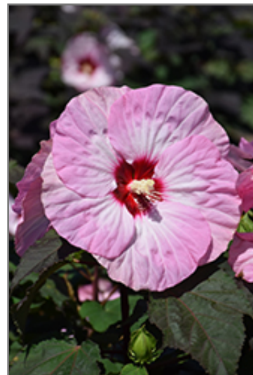
Summerific Spinderella Hibiscus flowers

This plant will require occasional maintenance and upkeep, and is best cleaned up in early spring before it resumes active growth for the season. It is a good choice for attracting butterflies and hummingbirds to your yard. Gardeners should be aware of the following characteristic(s) that may warrant special consideration;