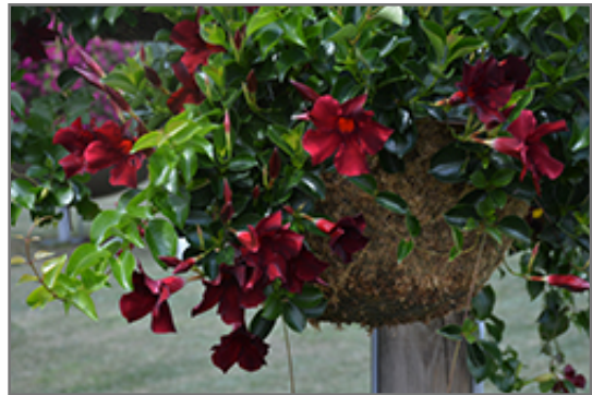
Diamantina Opal Merlot Mandevilla flowers