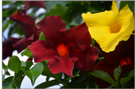
Diamantina Opal Merlot Mandevilla flowers

This plant is native to the tropics and prefers growing in moist environments with evenly warm conditions all year round. In our climate, it is usually grown as an outdoor annual in the garden or in a container. If you want it to survive the winter, it can be brought in to the house and provided with special care, and then returned to the garden the following season. In its preferred tropical habitat, it can grow to be around 5 feet tall at maturity, with a spread of 16 inches. However, when grown as an annual or when overwintered indoors, it can be expected to perform differently, and its exact height and spread will depend on many factors; you may wish to consult with our experts as to how it might perform in your specific application and growing conditions.