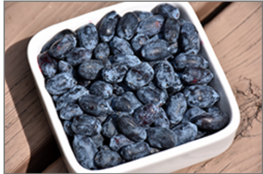
Boreal Beast Honeyberry fruit

This is a dense multi-stemmed deciduous shrub with a more or less rounded form. Its average texture blends into the landscape, but can be balanced by one or two finer or coarser trees or shrubs for an effective composition. This plant will require occasional maintenance and upkeep, and is best pruned in late winter once the threat of extreme cold has passed. It is a good choice for attracting butterflies to your yard. It has no significant negative characteristics.