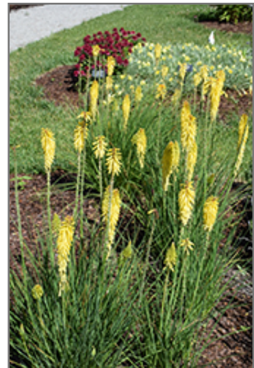
Glow Stick Torchlily in bloom