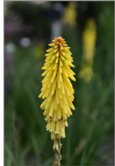
Glow Stick Torchlily flowers