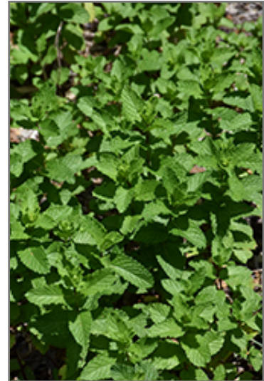
Apple Mint foliage

Aside from its primary use as an edible, Apple Mint is suitable for the following landscape applications;