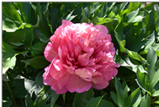
Hillary Peony flowers