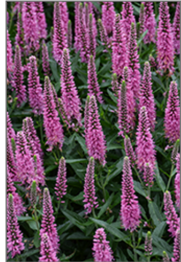
Skyward Pink Long-leaf Speedwell flowers

Skyward Pink Long-leaf Speedwell is recommended for the following landscape applications;