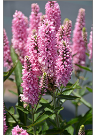
Skyward Pink Long-leaf Speedwell flowers

Skyward Pink Long-leaf Speedwell is a fine choice for the garden, but it is also a good selection for planting in outdoor pots and containers. It is often used as a 'filler' in the 'spiller-thriller-filler' container combination, providing a mass of flowers against which the larger thriller plants stand out. Note that when growing plants in outdoor containers and baskets, they may require more frequent waterings than they would in the yard or garden.