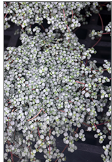
Aquamarine Pilea foliage