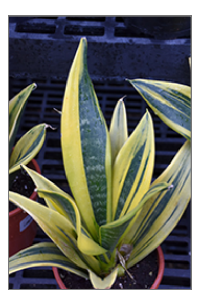
Golden Flame Snake Plant flowers

When grown indoors, Golden Flame Snake Plant can be expected to grow to be about 3 feet tall at maturity, with a spread of 24 inches. It grows at a slow rate, and under ideal conditions can be expected to live for approximately 10 years. This houseplant performs well in both bright or indirect sunlight and strong artificial light, and can therefore be situated in almost any well-lit room or location. It is very adaptable to both dry and moist soil, but will not tolerate any standing water. The surface of the soil shouldn't be allowed to dry out completely, and so you should expect to water this plant once and possibly even twice each week. Be aware that your particular watering schedule may vary depending on its location in the room, the pot size, plant size and other conditions; if in doubt, ask one of our experts in the store for advice. It will benefit from a regular feeding with a general-purpose fertilizer with every second or third watering. It is not particular as to soil pH, but grows best in sandy soil. Contact the store for specific recommendations on pre-mixed potting soil for this plant.