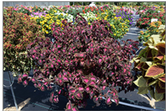
TrailBlazer Road Trip Coleus