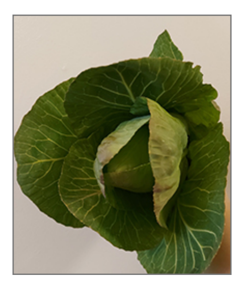
Early Jersey Wakefield Cabbage fruit

This plant is typically grown in a designated vegetable garden. It should only be grown in full sunlight. It does best in average to evenly moist conditions, but will not tolerate standing water. This plant is a heavy feeder that requires frequent fertilizing throughout the growing season to perform at its best. It is not particular as to soil pH, but grows best in rich soils. It is somewhat tolerant of urban pollution. Consider applying a thick mulch around the root zone over the growing season to conserve soil moisture. This is a selected variety of a species not originally from North America.