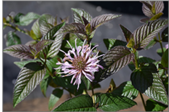
Midnight Oil Eastern Beebalm flowers

This vigorous, clumping selection presents deep purple new foliage and light pink pincushion flowers in spring, followed by purple seed heads; tolerates drought and infertile, rocky soils; great for massing along borders; mildew resistant