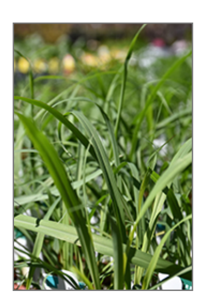
Lemon Grass foliage

This plant is quite ornamental as well as edible, and is as much at home in a landscape or flower garden as it is in a designated herb garden. It should only be grown in full sunlight. It does best in average to evenly moist conditions, but will not tolerate standing water. It is not particular as to soil pH, but grows best in rich soils. It is highly tolerant of urban pollution and will even thrive in inner city environments. Consider applying a thick mulch around the root zone in winter to protect it in exposed locations or colder microclimates. This species is not originally from North America. It can be propagated by division.