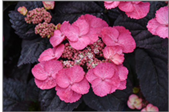
Pink Dynamo Hydrangea flowers