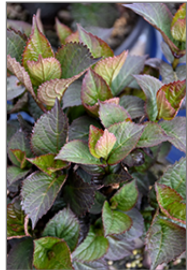
Pink Dynamo Hydrangea foliage