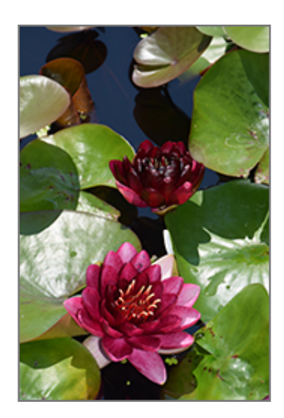
Almost Black Hardy Water Lily flowers