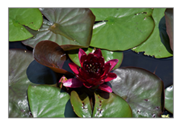
Almost Black Hardy Water Lily flowers

Almost Black Hardy Water Lily is ideally suited for growing in a pond, water garden or patio water container, and is recommended for the following landscape applications;