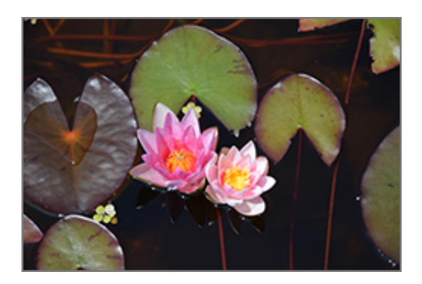
Joanne Pring Hardy Water Lily flowers