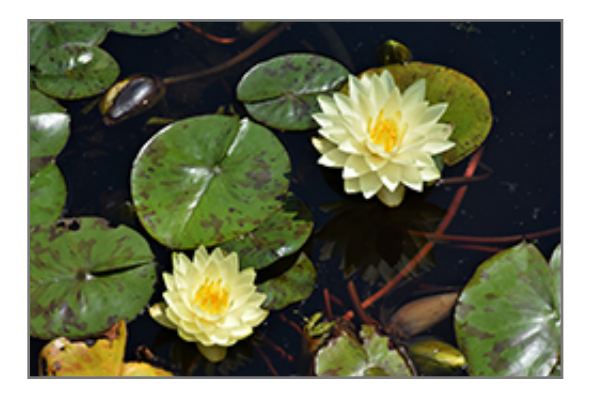
Lemon Chiffon Hardy Water Lily flowers