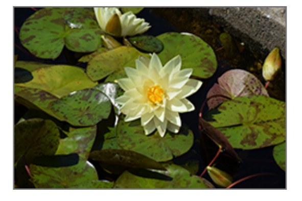
Lemon Chiffon Hardy Water Lily flowers