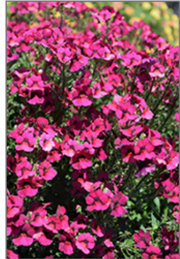
Nesia Magenta Nemesia flowers