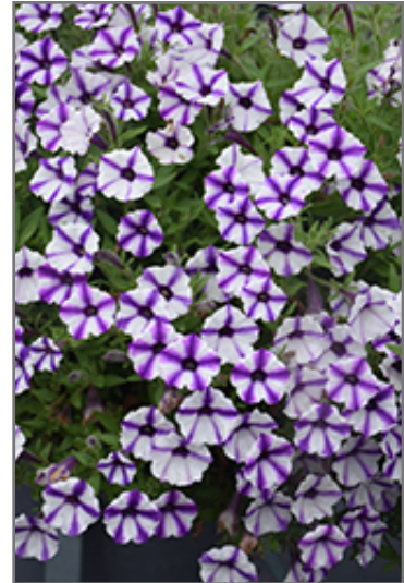
Supertunia Mini Vista Violet Star Petunia flowers

This plant will require occasional maintenance and upkeep. Trim off the flower heads after they fade and die to encourage more blooms late into the season. It is a good choice for attracting butterflies and hummingbirds to your yard, but is not particularly attractive to deer who tend to leave it alone in favor of tastier treats. It has no significant negative characteristics.