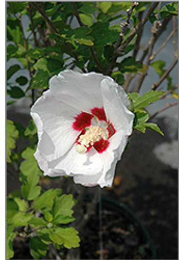
Red Heart Rose Of Sharon flowers

Red Heart Rose Of Sharon is recommended for the following landscape applications;