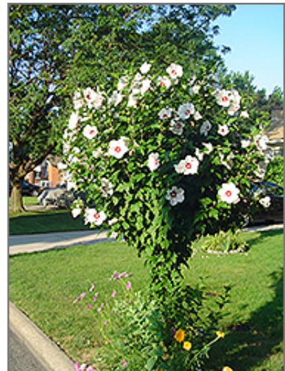
Red Heart Rose Of Sharon in bloom