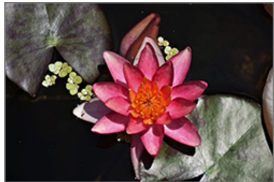
Sultan Hardy Water Lily flowers